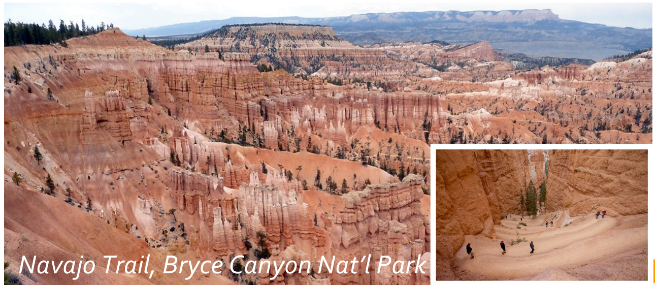
Navajo Trail, Bryce Canyon Nat'l Park

As a part of a California Partnership Academy your high school experience is much more than classroom work. In the CORE Academy teachers work with industry partners to train you with marketable skills so that you have a skill set when you exit high school. You will have the opportunity to partake in a Federal invasive plant study that will provide you experience with Geographical Information System (GIS) as well as identification of invasive and native plants to the Southwest.